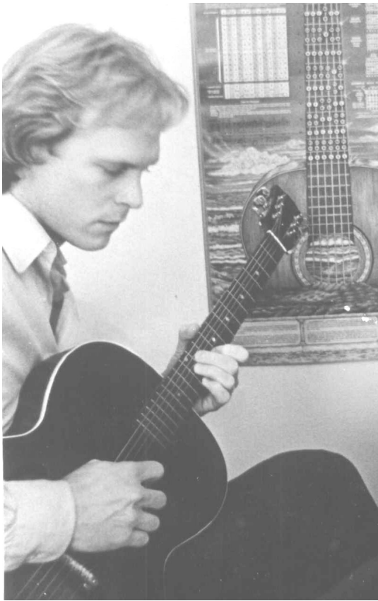
Keith & The Guitar Poster (1980)